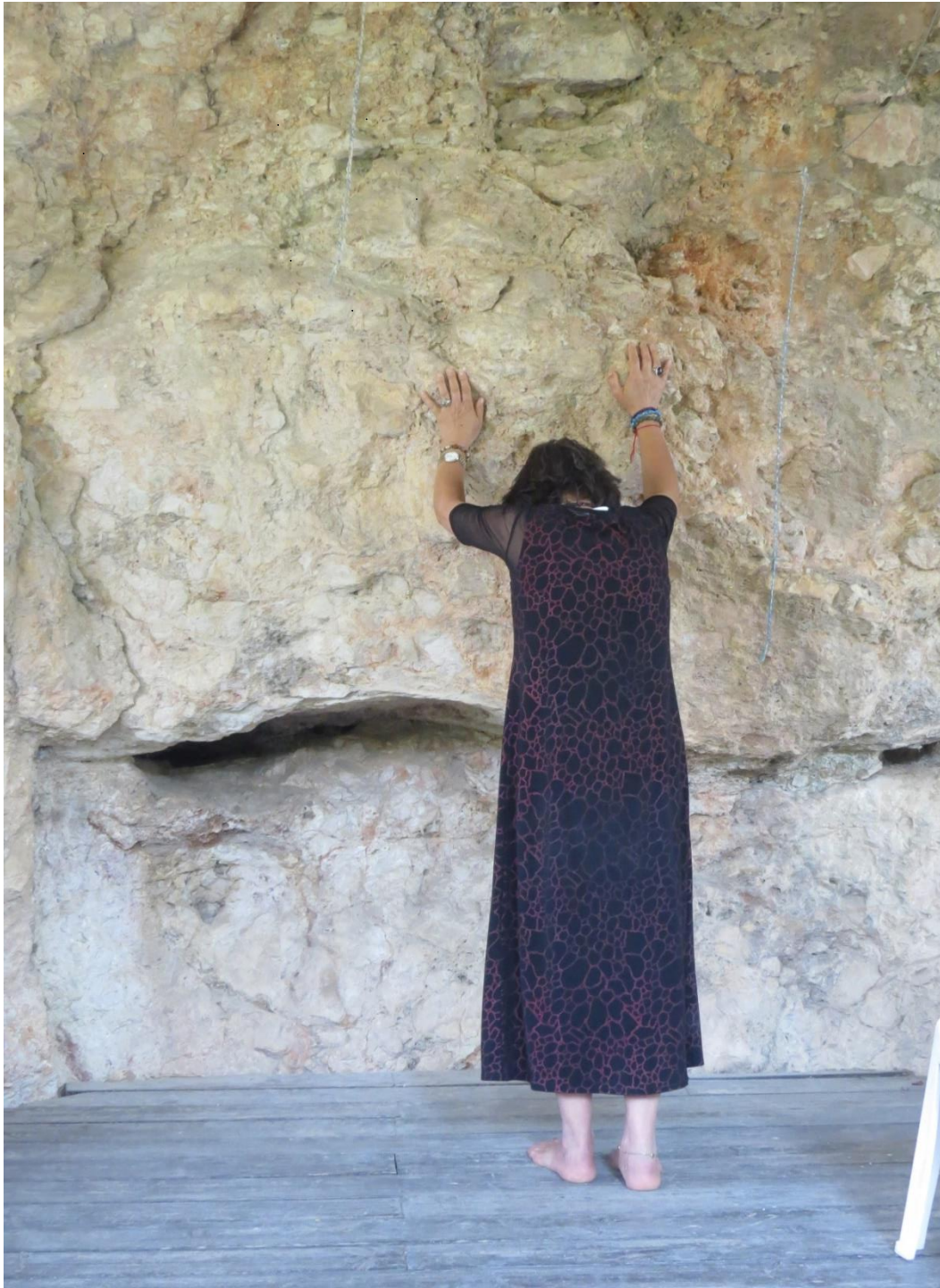
Mary worshipping God after realizing the blood of Christ was below her on the Mercy Seat of the Ark of the Covenant! You can see the earthquake crack to her left that runs down to the cross hole and on down to the chamber where the Ark is located.