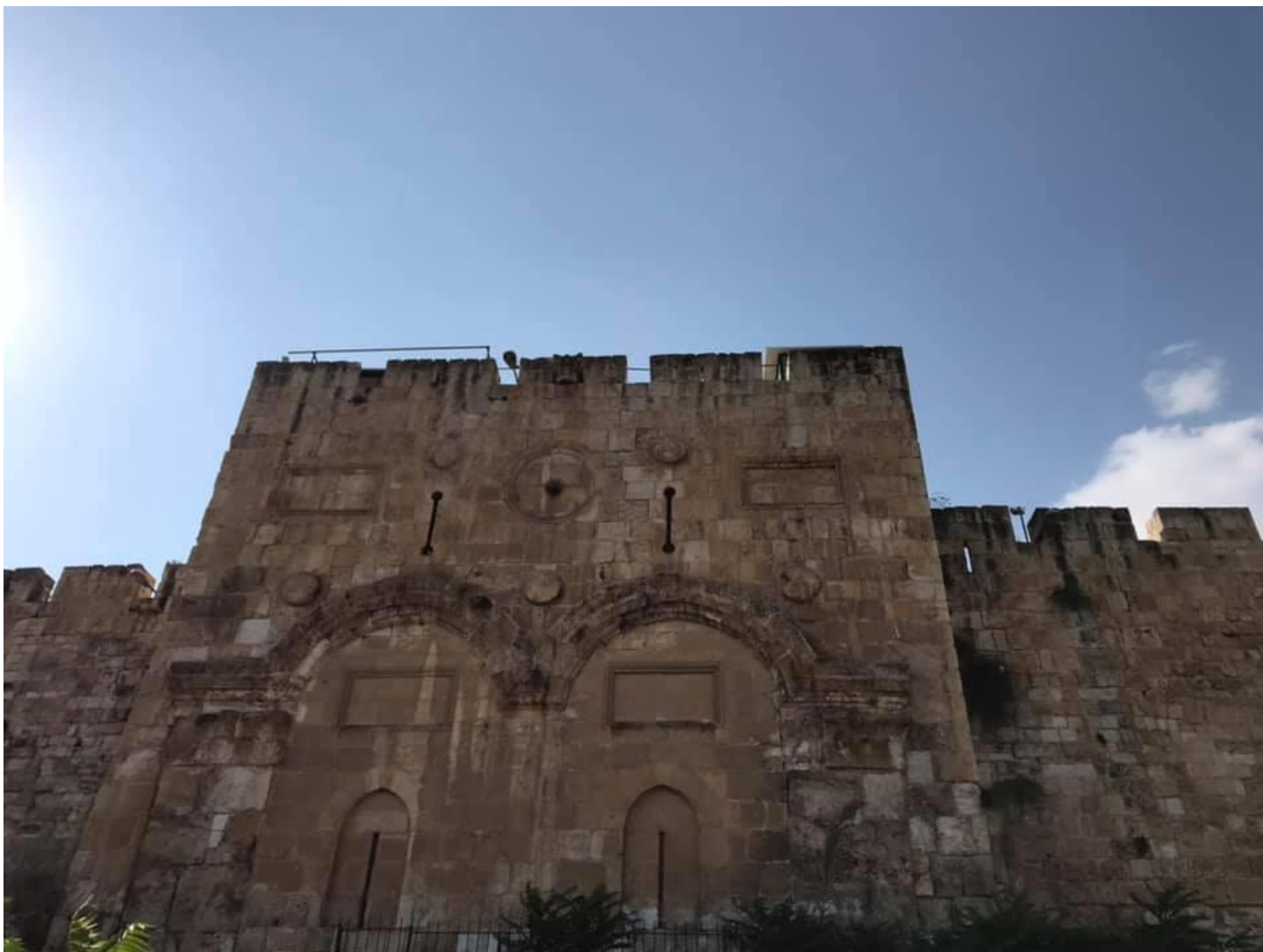
The Eastern Gate shut by the Muslims with a graveyard put in front of it.

Ezekiel 44:1 “Then He brought me back to the outer gate of the sanctuary which faces toward the east, but it was shut. 2 And the LORD said to me, “This gate shall be shut; it shall not be opened, and no man shall enter by it, because the LORD God of Israel has entered by it; therefore, it shall be shut. 3 As for the Prince, because he is the Prince, He may sit in it to eat bread before the LORD; he shall enter by way of the vestibule of the gateway, and go out the same way. ”