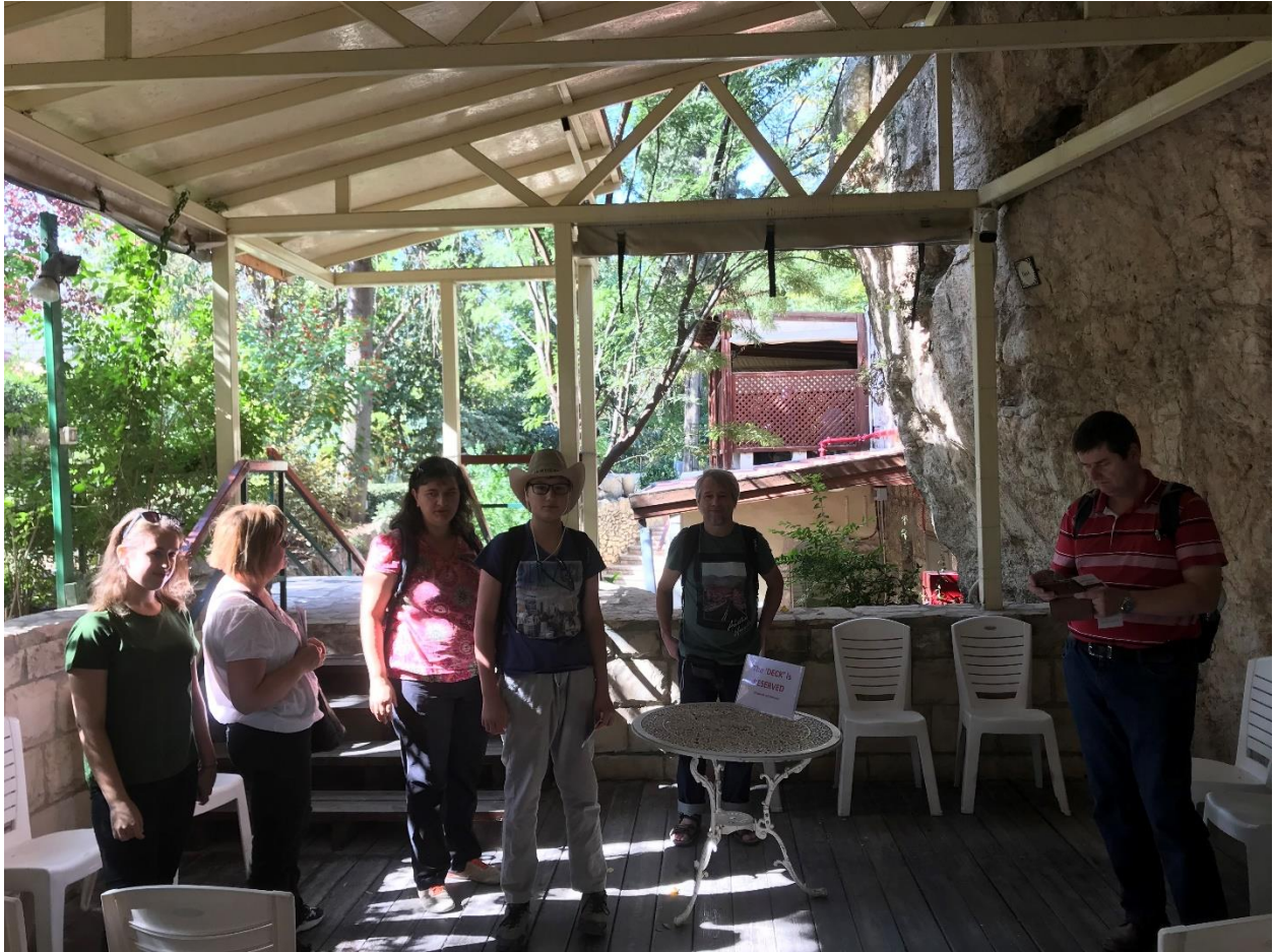
The group from the Czech Republic. We spent over an hour talking the things of God revealed in this discovery.