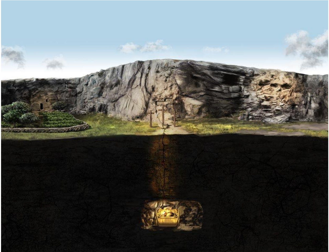
THE MOST HOLY PLACE

To God be the Glory, Great things He has done, so loved He the world that He gave us His Son. Who yielded His life an atonement for sin and opened the life gates that all may come in! Praise the Lord! Praise the Lord! Let the earth hear His voice! Praise the Lord! Praise the Lord! Let the people rejoice! O come to the Father through Jesus the Son and give Him the glory, great things He has done!