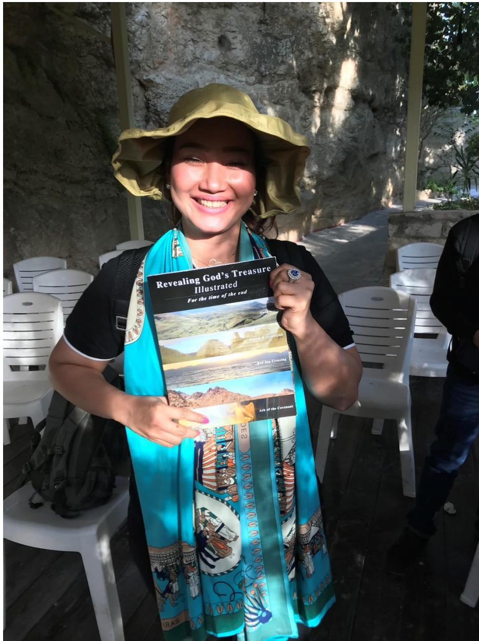
They were happy to get this book unknown to most!

I began to realize God was using me in that spot so I decided to return the next day and see who else the Lord would send my way. The next day was the Sabbath and I was so blessed that a large group of Christians from Zimbabwe came to the porch deck where I was sitting to have a communion service. They invited me to stay, and on my first Sabbath in Jerusalem, there I was having communion right where our Savior's body was broken and bled. And right above the Ark of the Covenant! What a profound experience. Words cannot express my gratitude and praise and love! They sang and I sang, and the Spirit was there. After the service they all came back to me, the only white man there, and hugged me and praised God with me. What love in the family of God!