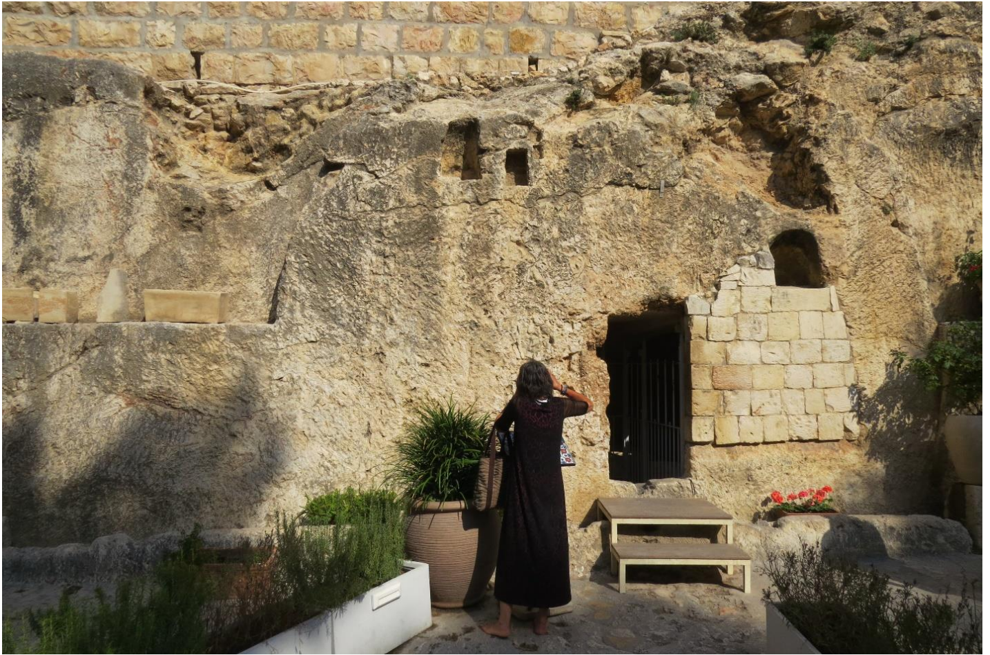
Mary at the Empty Tomb