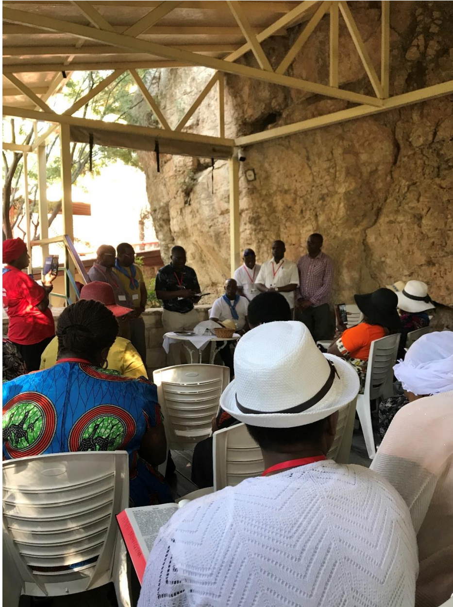
Group from Zimbabwe I had communion with at the Altar of Christ with His blood below!

And this beautiful worship moment was on the Sabbath. Imagine taking communion at the very altar where Christ as High Priest offered up Himself and His blood still there on the Mercy Seat of the Ark of the Covenant below. I was beside myself. Still am! Glory to God for the things He has done!